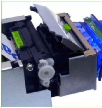
Modular design reduces maintenance